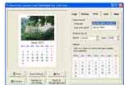
Photo Print Calendar is a powerful tool for creating common wall calendars. You can use your own images as main picture for every single month. Photo Print Calendar is international and allows users to format the view of days and weeks in different local ways. The easy to use interface gives access to all options and allows creating your own calendar in a few minutes. Nice December tool, even for creating personal (Christmas) gifts. http://www.photo- freeware.net/photo-print-calendar.php

( Came across this by accident – downloaded and found it easy to use and can be useful – Tony B)